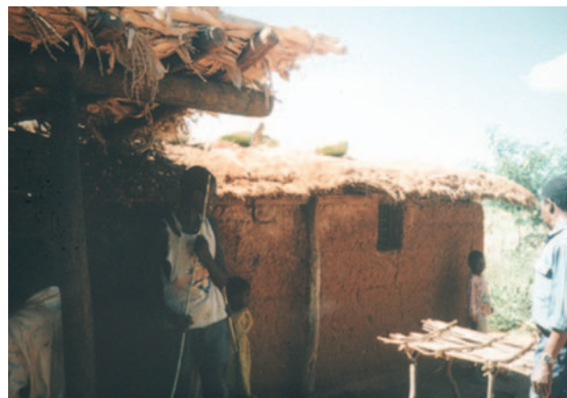
Figure 2. Traditional Tembe dwelling in Tanzania.

The vector is the soft tick, genus Ornithodoros ; the species complex Ornithodoros moubata is prevalent in sub-Saharan Africa. These ticks live in traditional housing and mainly feed nocturnally (Figures 2 and 3). The disease is transmitted either by saliva during tick feeding or in coxal fluid excreted during feeding. The tick feeds for a short time only (usually less than half an hour), then returns to the earth floor or walls of the house. Humans are