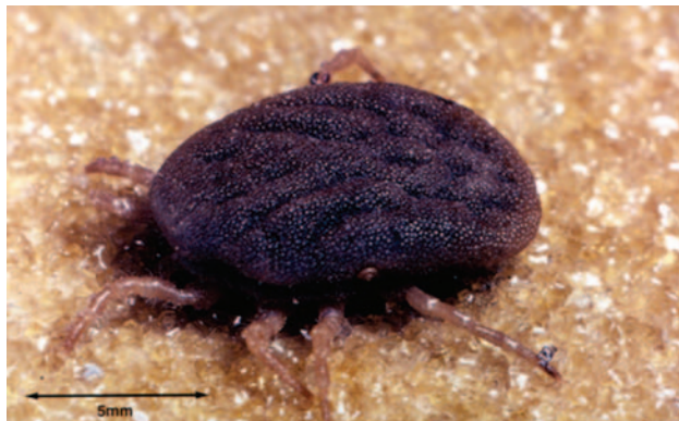
Figure 1. Ornithodoros moubata ticks that frequent traditional homes.

Borrelia duttonii , the cause of tickborne relapsing fever, is endemic to several countries in East Africa, such